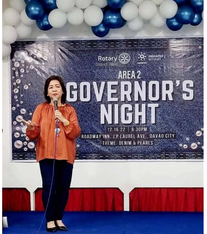
DG Lilu with her inspirational message.